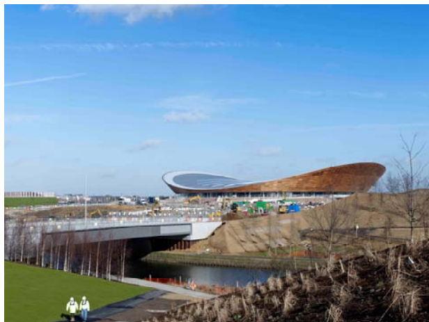
2012 Olympic Velodrome Hopkins Architects

Youth Factory, Mérida, Spain Selgascano, Gestaltskate and Jarex