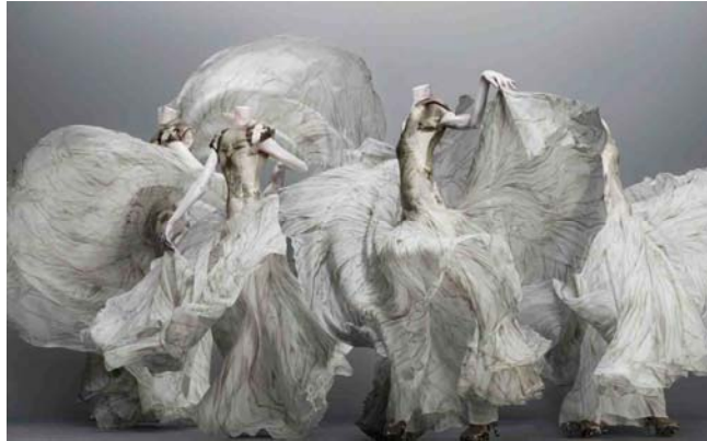
Alexander McQueen: Savage Beauty, The Costume Institute at the Metropolitan Museum, New York, USA