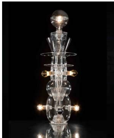
Totem no. 5 Ruy Teixeira, 2011 Bethan Laura Wood in collaboration with Pietro Viero