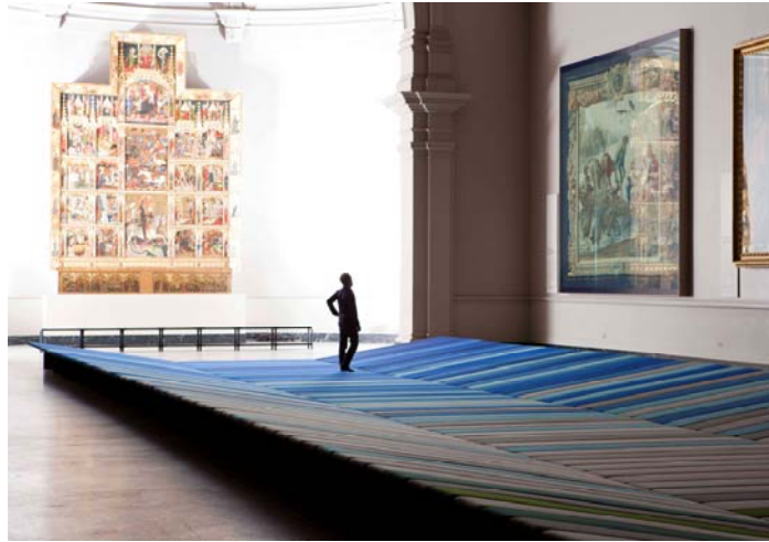
Textile Field at the Victoria and Albert Museum, London. Ronan and Erwan Bouroullec, fabric by Kvadrat