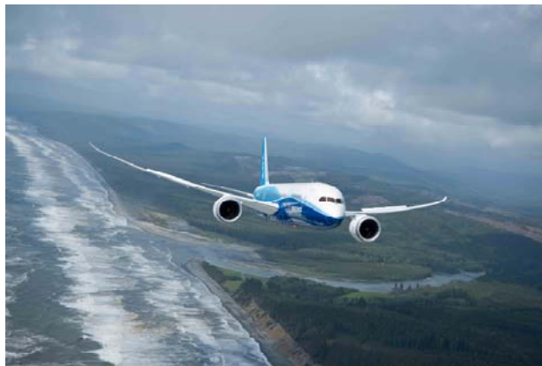
The Boeing 787 Dreamliner Ed Turner