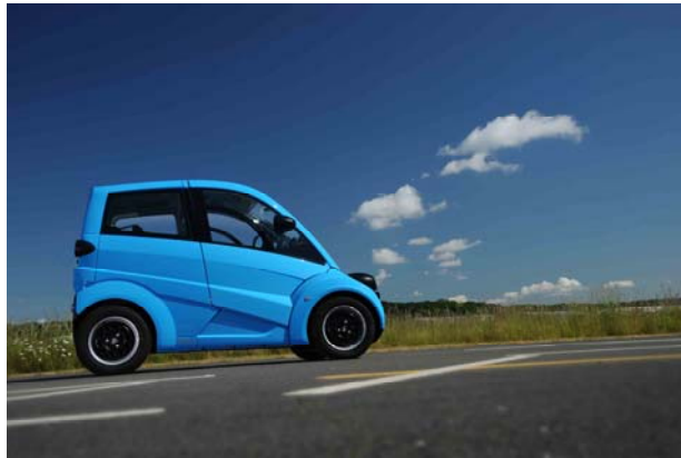
T.27 Electric Car Gordon Murray Design Limited

Taurus Electro G4 Pipistrel doo Ajdovscina